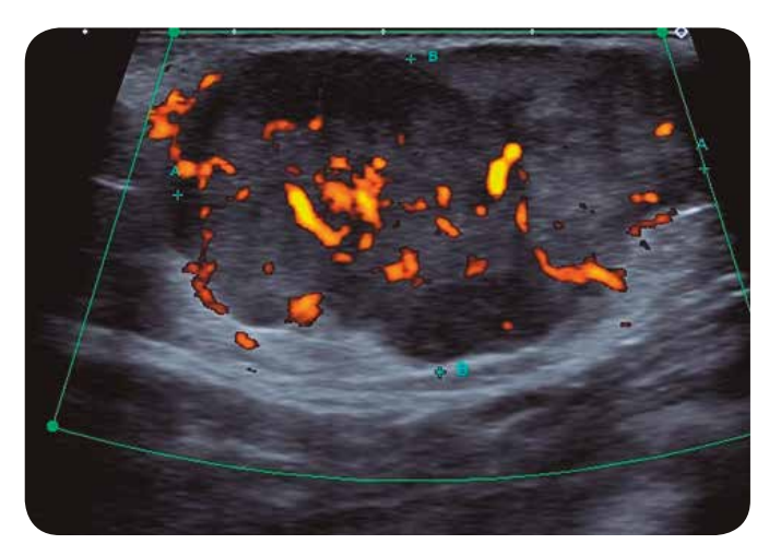
Figure 2. Ultrasound: nodular image, ovoid, with macrolobulations, hypoechoic, homogeneous, circumscribed, vascularized, without calcifications, located in the retroareolar region of the left breast, 3\times7 cm in its major diameters.