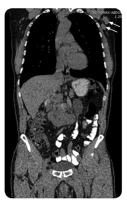
Figure 3. Thoracoabdominal CT: evidence of adenopathies in the left axillary region.